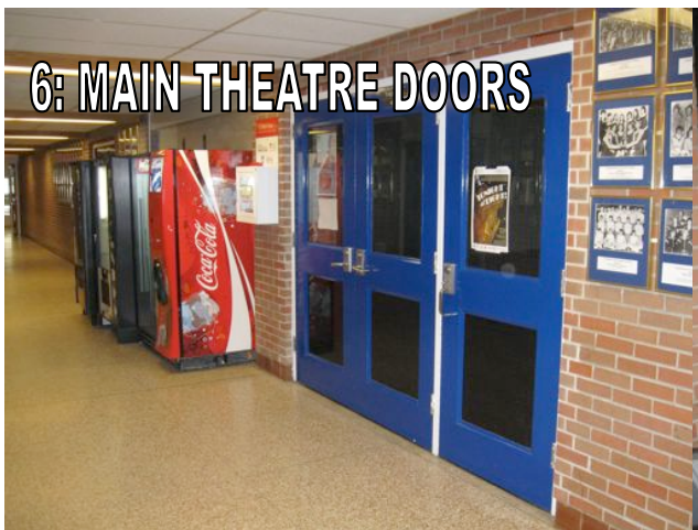
6: MAIN THEATRE DOORS