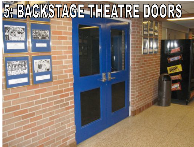
5: BACKSTAGE THEATRE DOORS